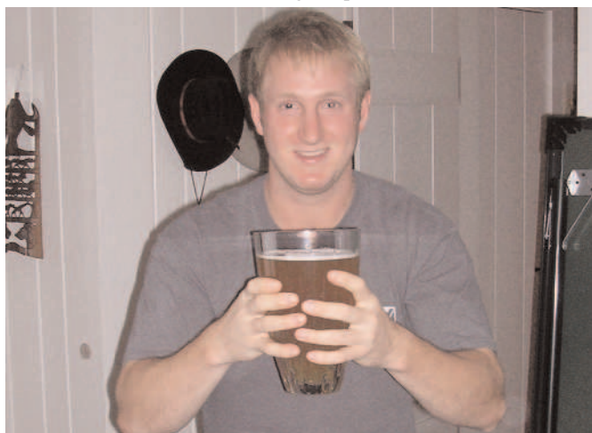
Nemo even dumps the dump bucket

DIRECTIONS FROM THE WEST: Take 84 E to exit 17. The exit ramp splits in two. Stay to the right. At the end of the exit ramp (yield/stop) you will merge onto Rte. 63 South. Follow Rte. 63 South to the first light (200-300 yards). At the light take a right on Country Club Rd (Maples restaurant will be up on the right before you make the turn). Follow this over the hill, and at the bottom you will turn right on Rte. 188 (you can only go left or right there) You are now on Rte 188 (Whittemore Road). Take 188 to the first left (past the split rail fence), Shadduck Rd, and make a left. Ours is the second house on the right. The corner of Shadduck & Lawson. The driveway entrance is on Lawson. It's a little Sage Cape with a White Mailbox.