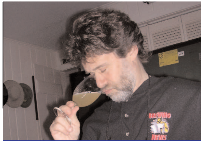
The Host's Heroic Nose

It took more than six months of long-term blood-thinning treatment to restore the man's normal vision -- and to get rid of the headache, the doctors reported.