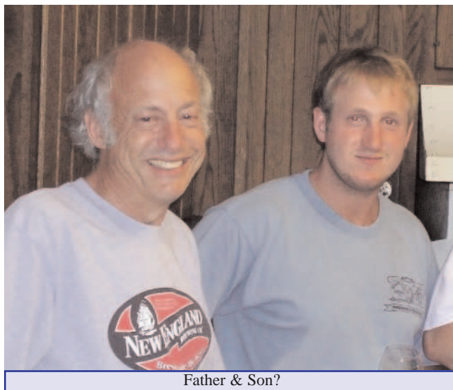
Father & Son?

From Monroe - Follow Rt 25 to Newtown flagpole. Turn right onto Church Hill Road. At approximately fifth light (bottom of hill in Sandy Hook), turn left onto Glen Hill Road. * See above.