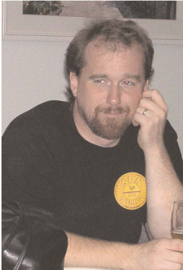
Rodin's original model for The Thinker.

There is going to be a 2004 nude YAHOOOS and YAHOOTERS calendar. Several exhibitionists have already signed on as models, but we could use a couple more. Any potential YAHOOOS models should contact the Nurse. YAHOOTERS will be personally auditioned by me.