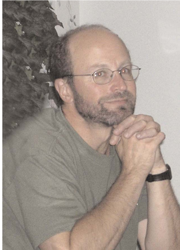
The Postman didn't ring twice, but he did make a rare appearance.