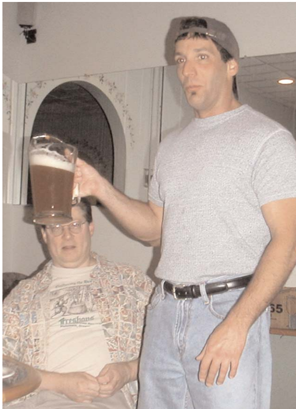
The buff host.

From Rt. 8 southbound: Take Exit 8, stay to the right on the exit until you are on Nichols Ave. At 3rd light, turn left onto Connors Lane; then the 4th left onto Bunnell Ave. It's the 2nd on the left.