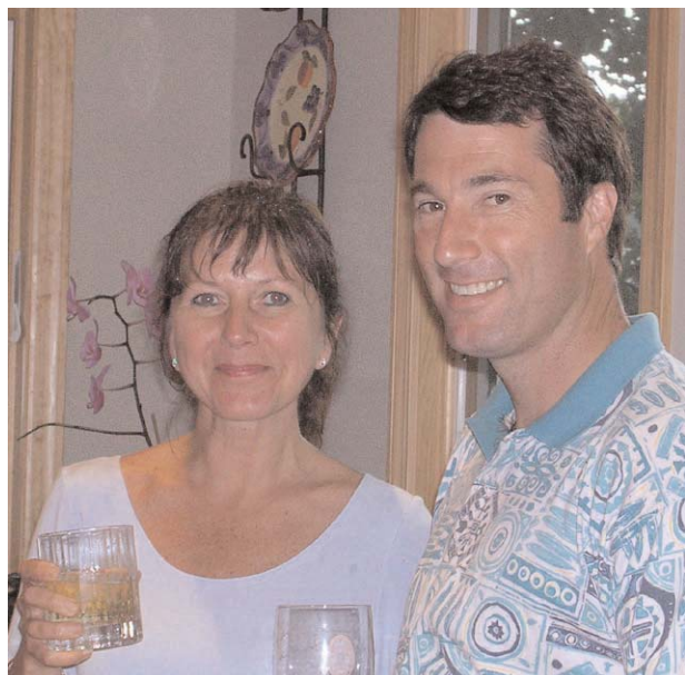
Chickenman & Genovaite, fresh from Lithuania

January 25 - Real Ale Festival, Bru Rm @ BAR, 254 Crowne St, New Haven, $10 in advance/$15 at the door includes admission and tickets worth $4 (each $2 ticket is good for ½ pint) and pizza; additional tickets available for $2 each, 1-5 pm, 60+ ales, Terry Boyd, 729-5445, www.winect.com/mountview