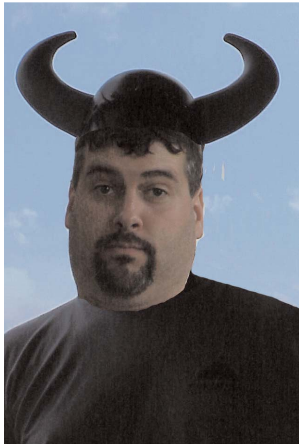
Brewer of Viking strength Baltic Porters